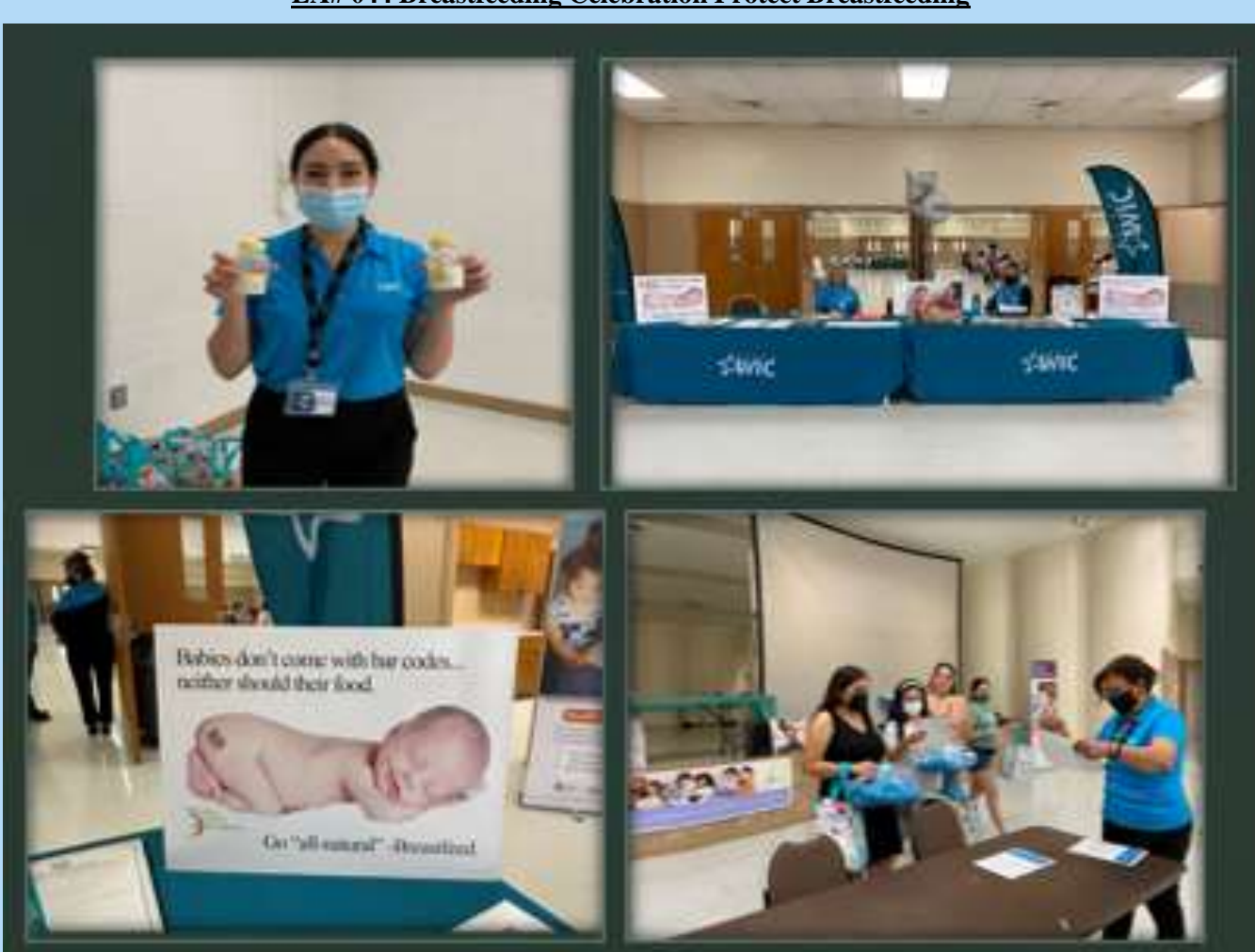
LA# 044 Breastfeeding Celebration Protect Breastfeeding

Our participants are loving our walk-up window and the less time they spend getting their benefits. Using the Gateway participants are able to upload documents, interviews, and counseling are been conducted via phone while the participants are at their homes, when they come to the window, they hand out their card and the wait time is no more than 15 minutes.